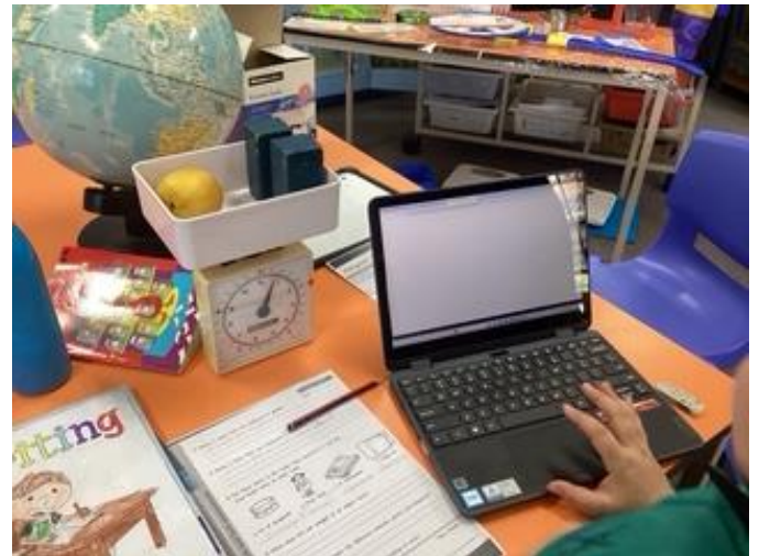
Weights and scales in Maths

Maverick took inventory of the scrabble letters and sorted them into piles from most to least frequently occurring.