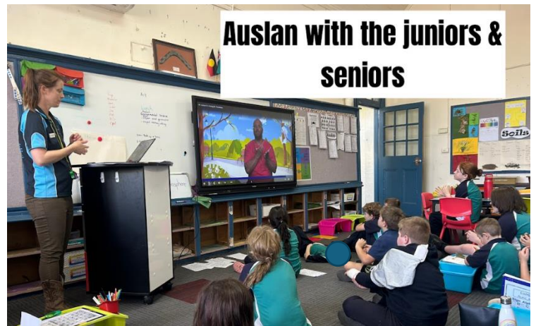
Auslan with the juniors & seniors