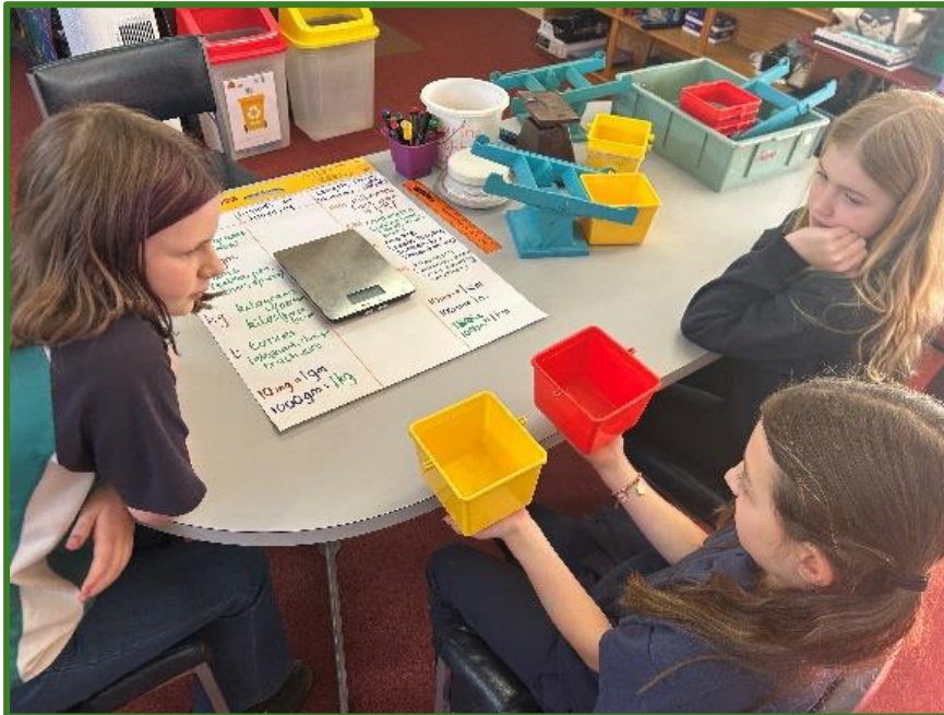
Developing skills in hefting at Strathbogie Campus