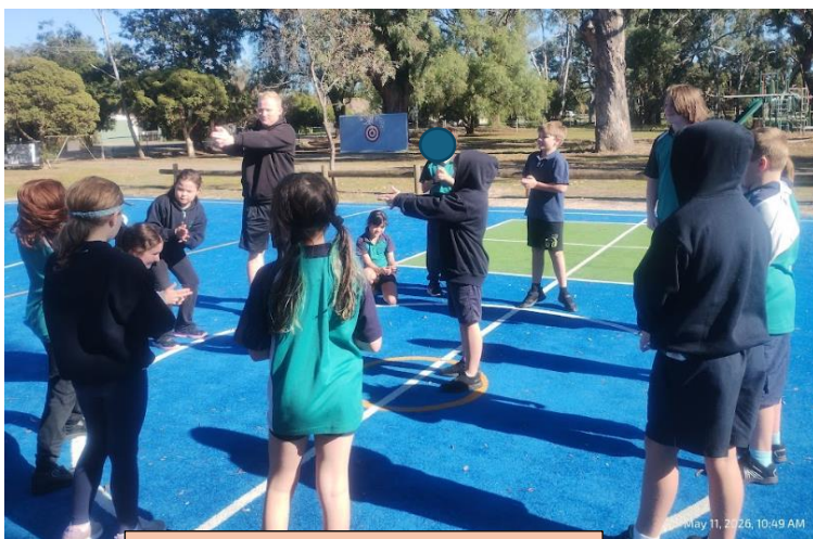
Working on reflexes and responses