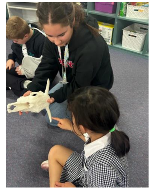
Sculptures and feeling different textures