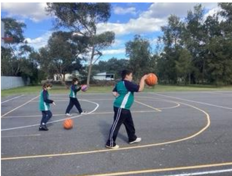
Basketball skills with the boys