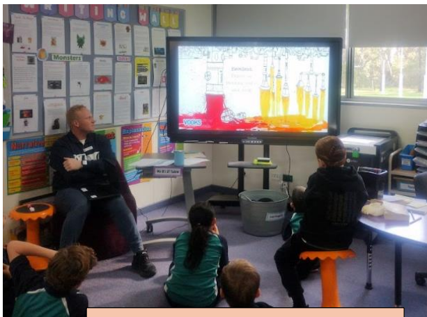
Colour Blocked by Ashley Sorenson