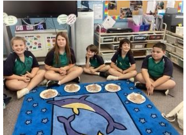
Our ANZAC biscuits