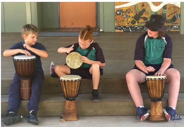
Lunch time drumming