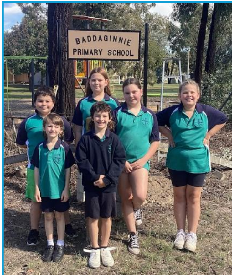
The reinstated Baddaginnie Primary School sign