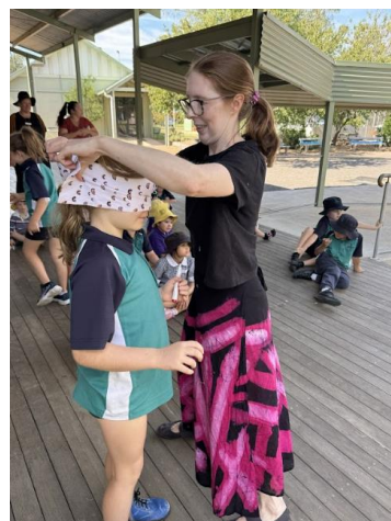
The Elephant Eye game

Every day at school counts towards shaping your child's future