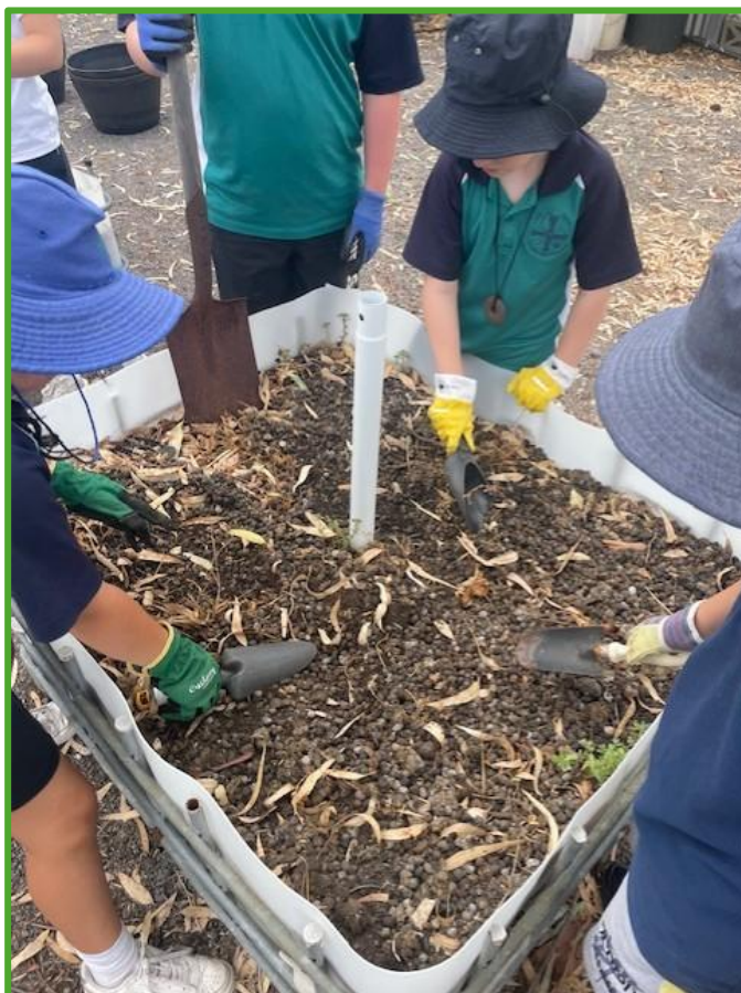
Environmental Science at Violet Town Campus