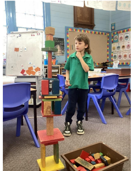
Maverick's teetering tower