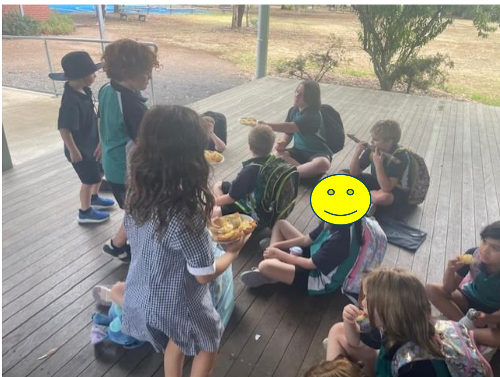
It's cool to be at school!