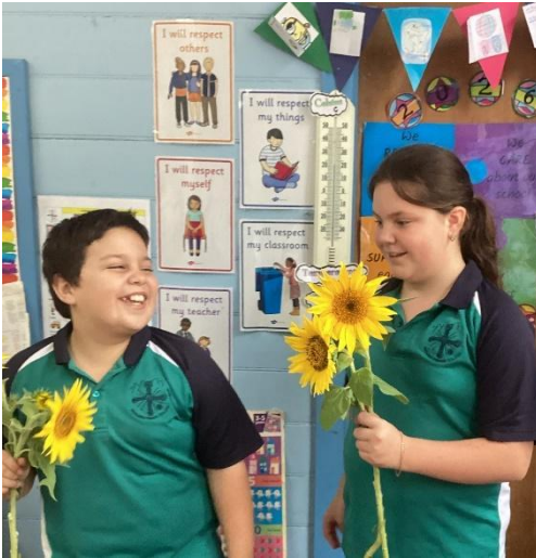
Sunflowers from Sarah's garden